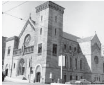
St. Brigid Church, 1964

St. Brigid's was founded at the height of the American Civil War, 10 years after the founding of the Archdiocese of San Francisco. Its parish boundaries were vast, comprising all the land north of Bush St., and all the land west from Larkin St. to the Pacific Ocean. Its boundary was expanded further in 1880, to Jones Street, so that