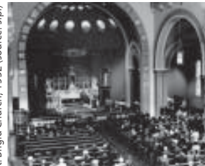
St. Brigid Church, 1952