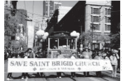
2003 St. Patrick's Day Parade

Another important anniversary was observed this year by St. Brigid's Church. For the 10 th consecutive year, it was represented in San Francisco's St. Patrick's Day Parade, held on Sunday, March 16. Parishioners and friends participated by marching and riding down Market Street, to the cheers of thousands of